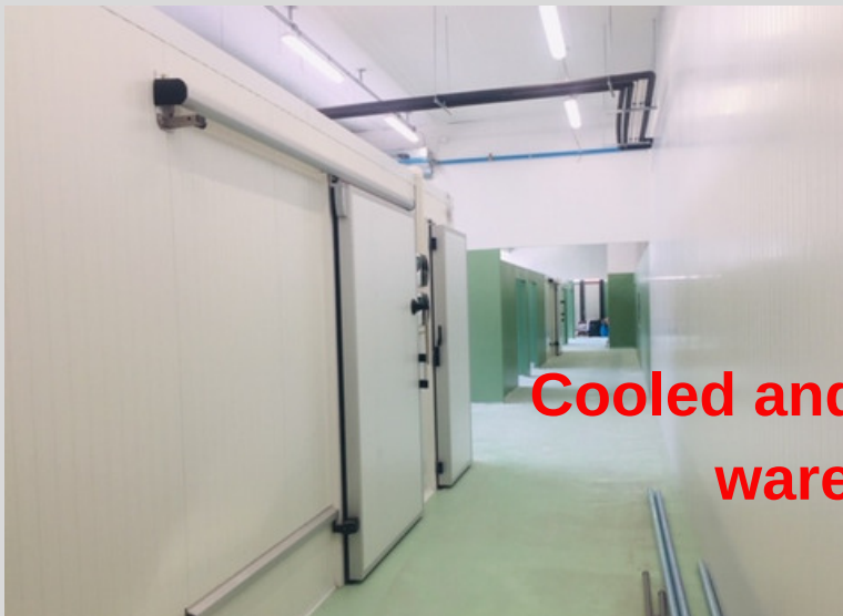
Cooled and deep-freeze warehouse