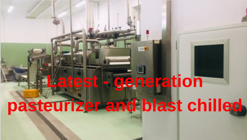
Latest - generation pasteurizer and blast chilled